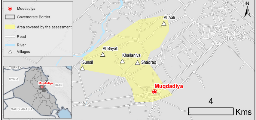
Map 1: Muqdadiya city and assessed villages to its north

Given the limited information available regarding the current situation in Muqdadiya city and the villages to its north, REACH – in partnership with the Returns Working Group (RWG) – launched a Rapid Overview of Areas of Return (ROAR) assessment in October 2018, which seeks to inform the recovery process in order to support durable and safe returns. The ROAR assessment looks at the motivations behind return, along with the current context related to protection issues, livelihoods, and the provision of basic services in areas of Iraq that are experiencing returns.